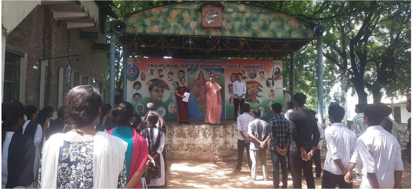
Our Principal Madam is Giving Speech on the occasion of World Drug Day