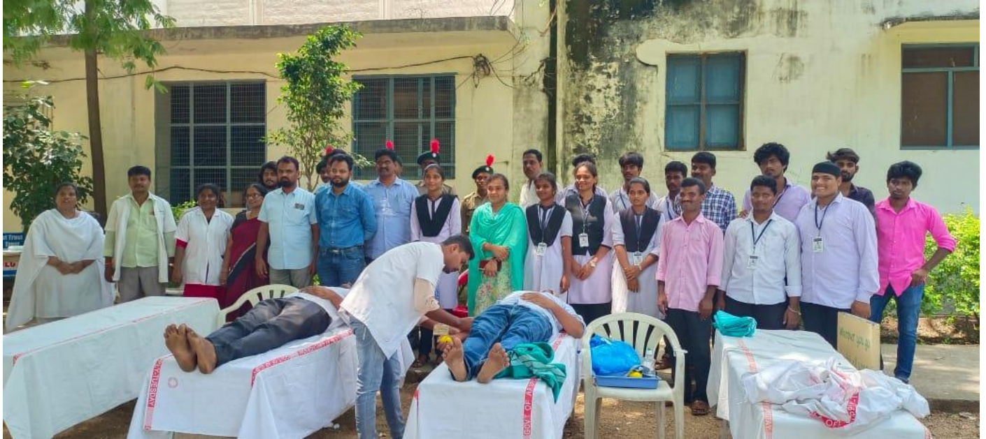
Students are donating Blood