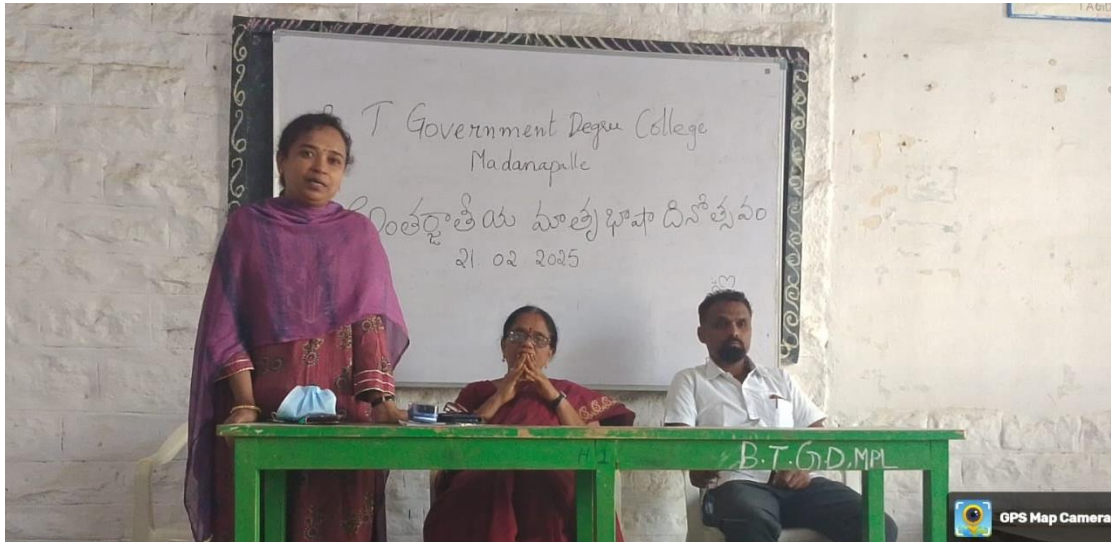
The teachers are giving Speeches on the Occasion of Telugu Basha Dinotsavam