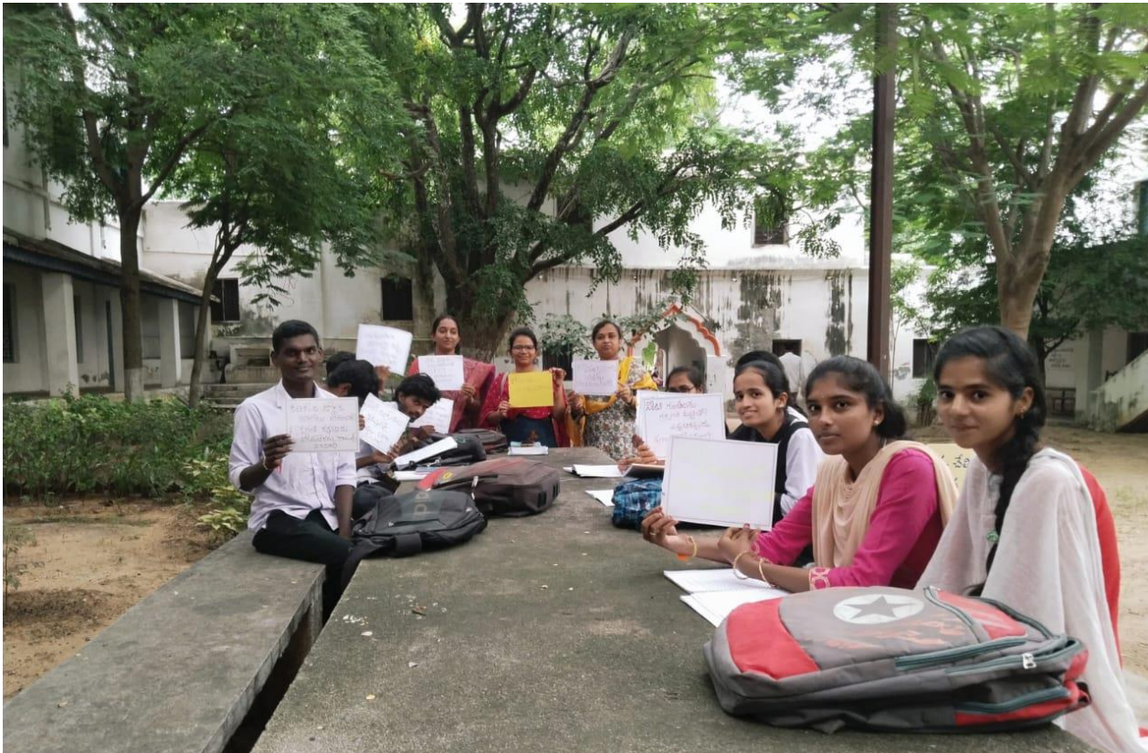
Students are preparing card boards to give Awareness on Ozone Day to the Public