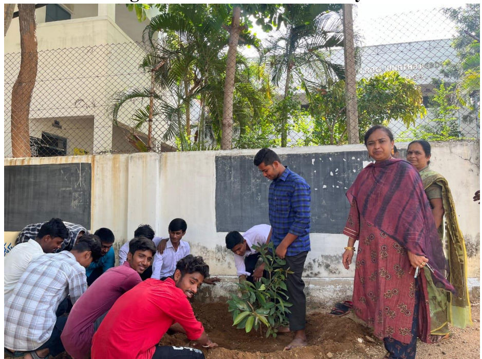
Students planting the plants on the occasion of NSS Day