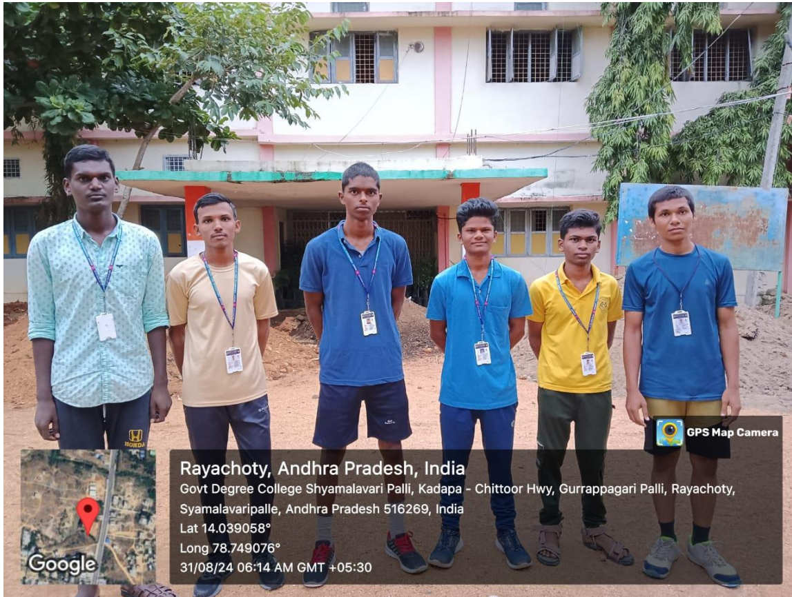
Pic of the Students that who Participated in 5k run in Rayachoti