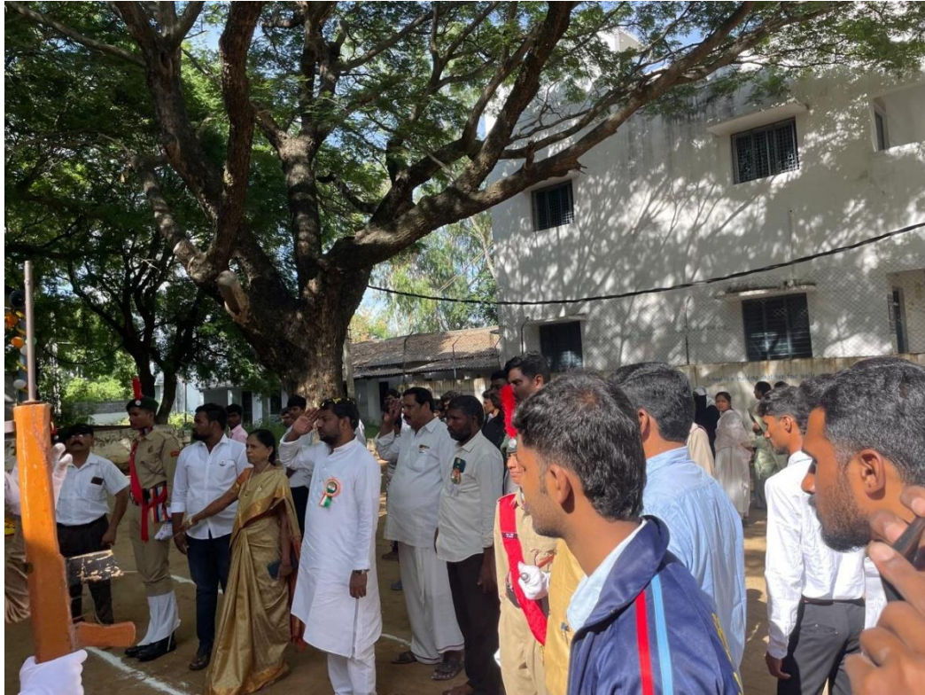
Our local MLA has visited our College on the Occasion of Independence Day