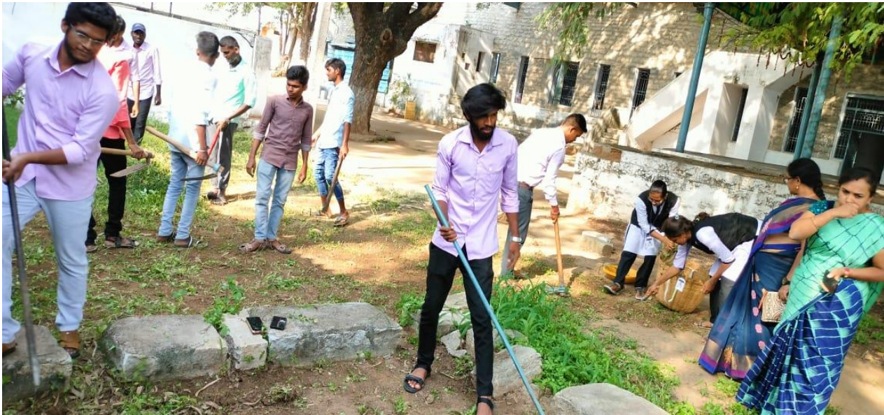
The students along with the Teachers are cleaning the campus