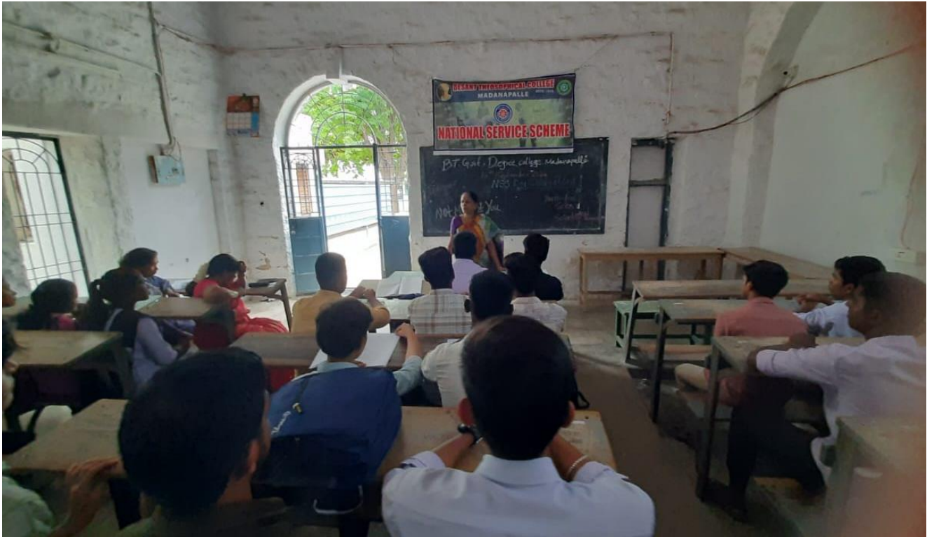
Principal madam is talking on the occasion of NSS day