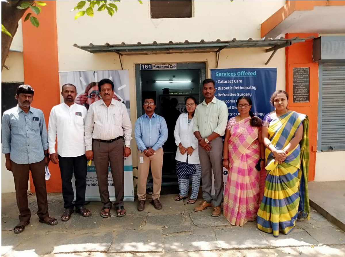
A pic with the Eye camp conducted Doctor's