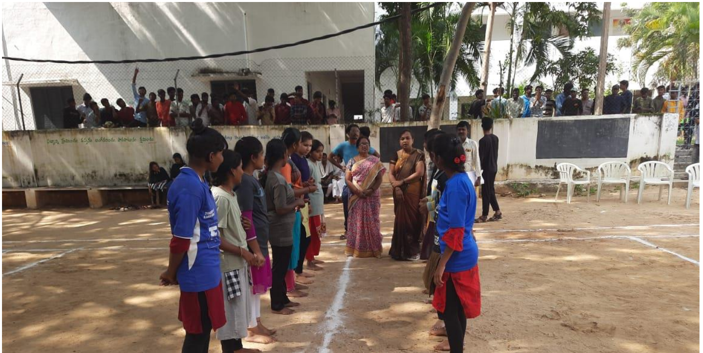
Teachers conducting Games to the Students on the Occasion of National Sports Day