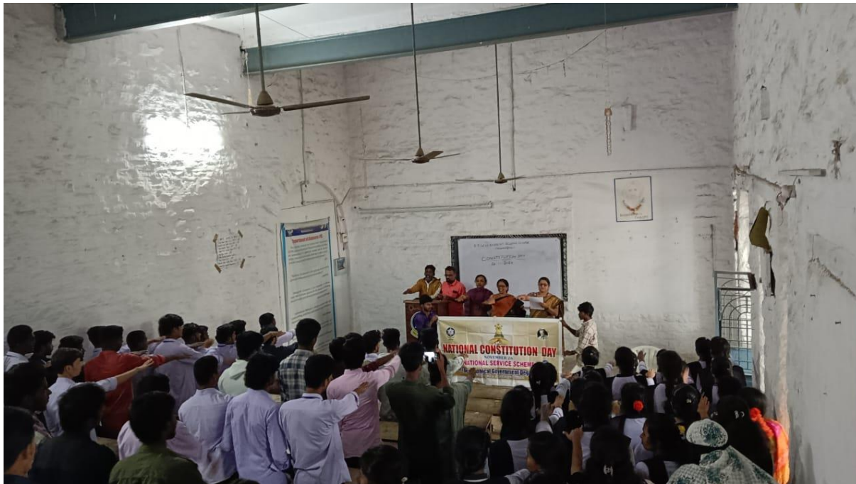
All the teachers and students are taking the pledge on the occasion of National constitution day