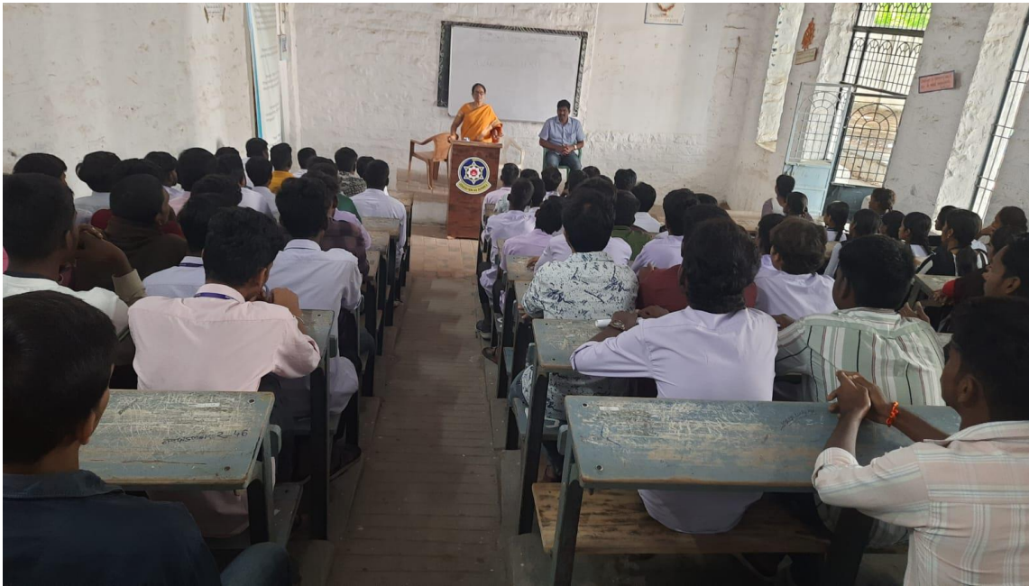
Teachers are giving speech in the occasion of Gandhi Jayanthi