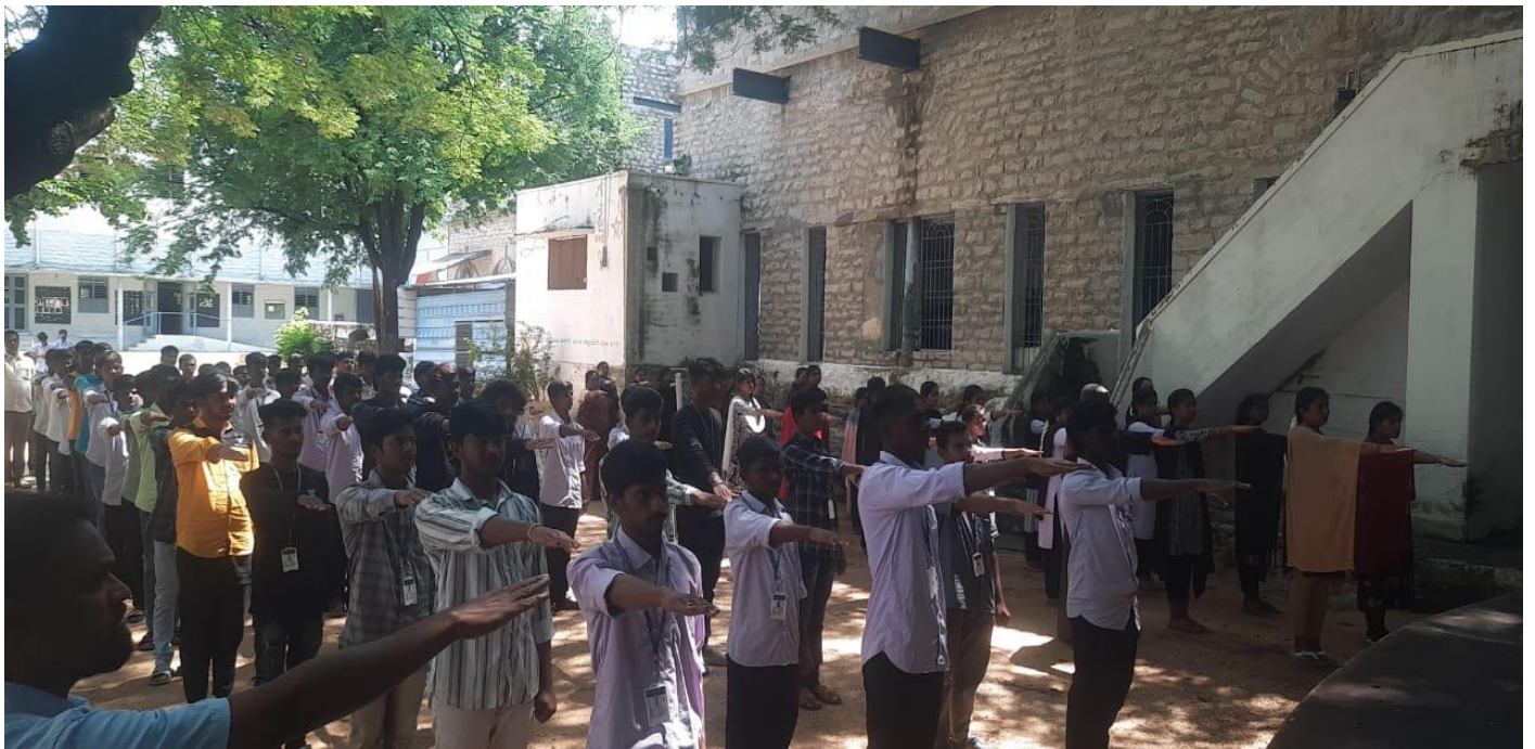
Students Doing pledge in control of Drug Addiction