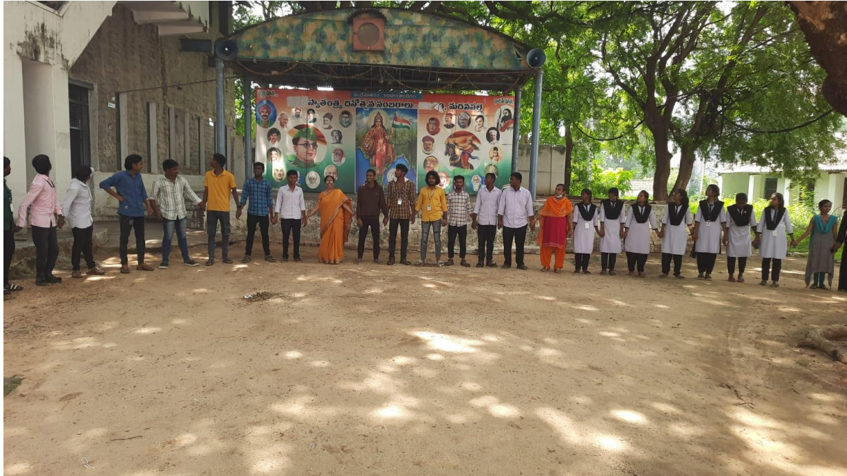
Students and Teachers joining their hands on the occasion of National Unity Day