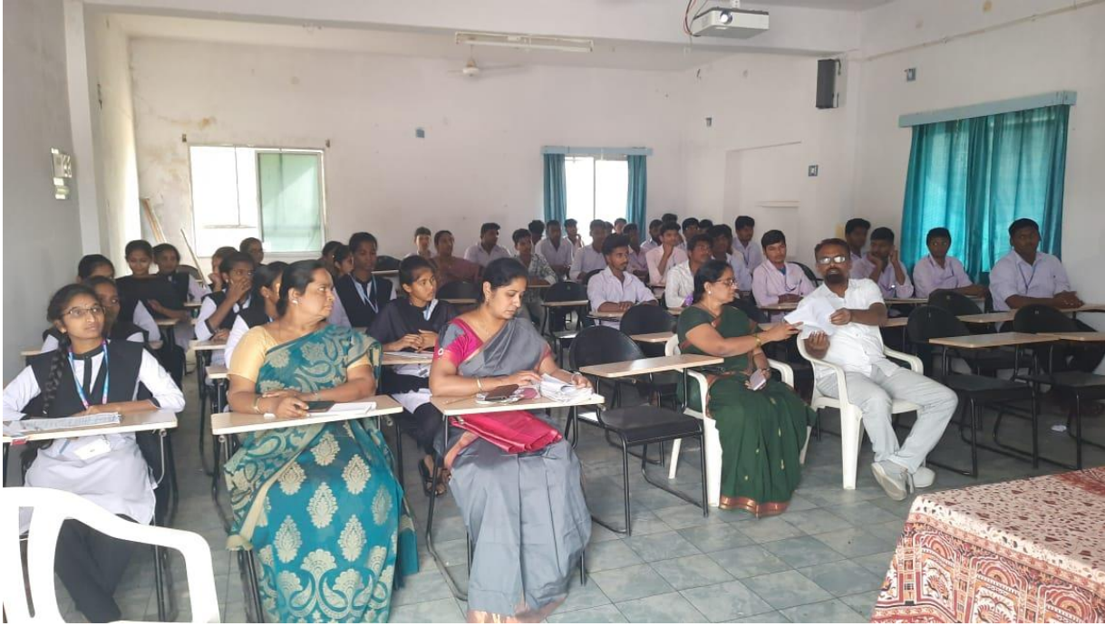
The teachers and the Students are Watching space day celebrations in VCR