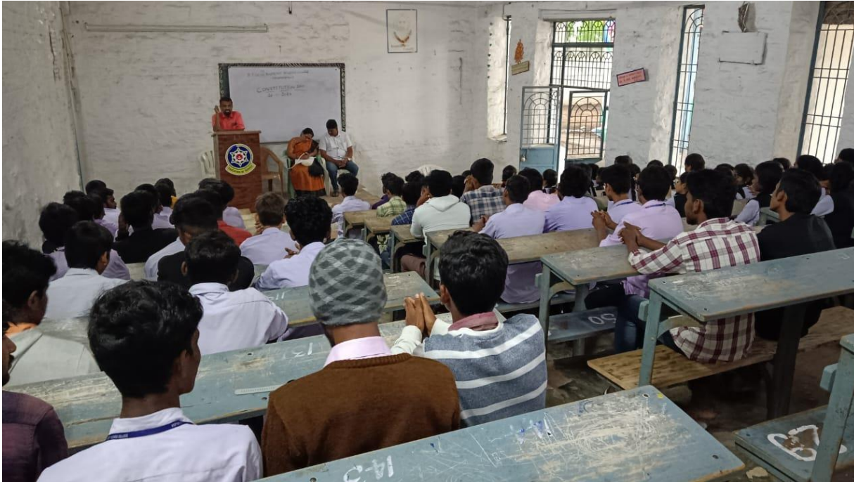
Teachers giving speech on the occasion of Girl Child Day