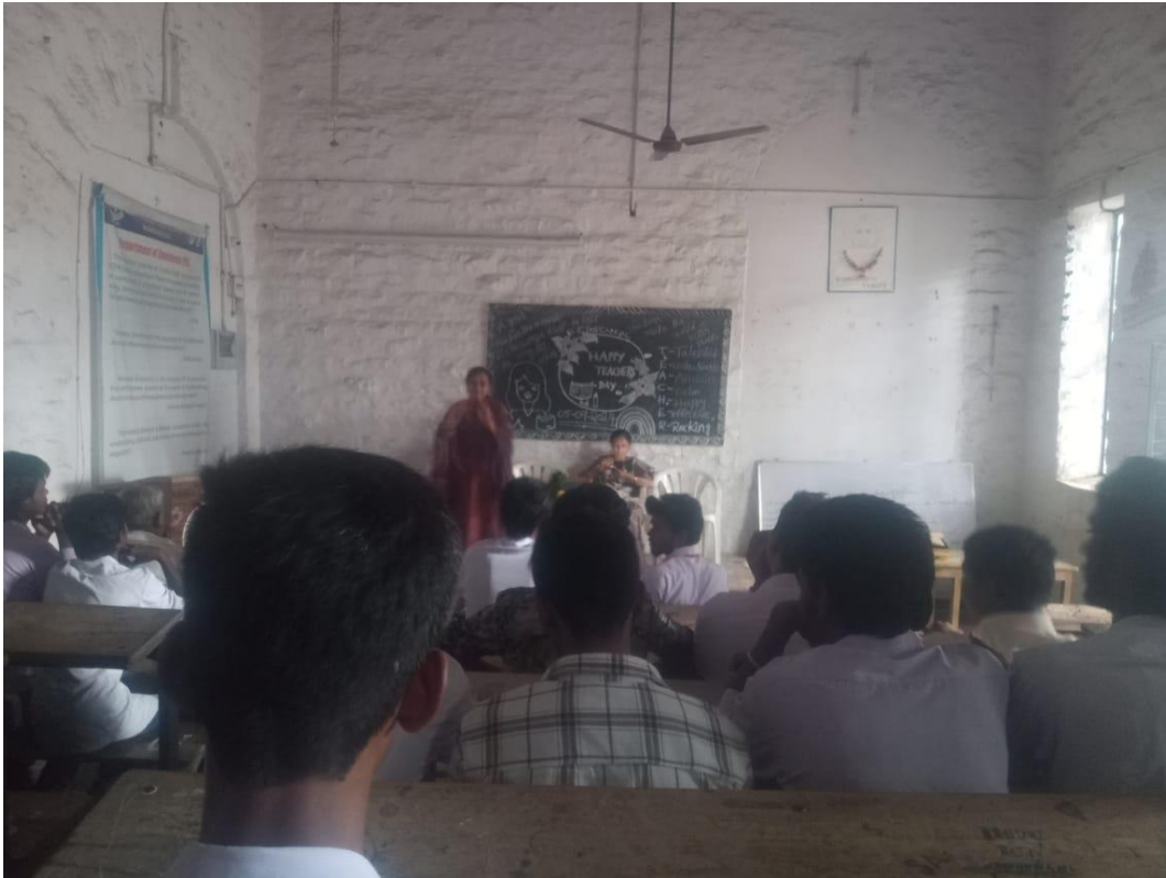
Teachers and the Students are giving speech on the occasion of Teacher's Day