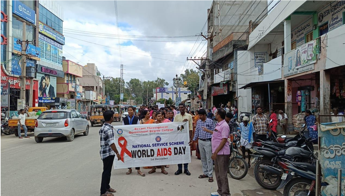
Students and teachers are going to the rally to give awareness on AIDS day to the Public